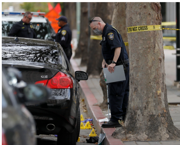
Photo from East Bay Times of the crime scene after the Sept 20th shooting on the street outside the Oakland City Council meeting room

At a September 20 th Oakland City Council Meeting, Maritime stakeholders reminded City Council on their promise on independent economic study and seaport compatibility measures, environmental justice and community benefits BEFORE their vote on the Oakland A's stadium project.