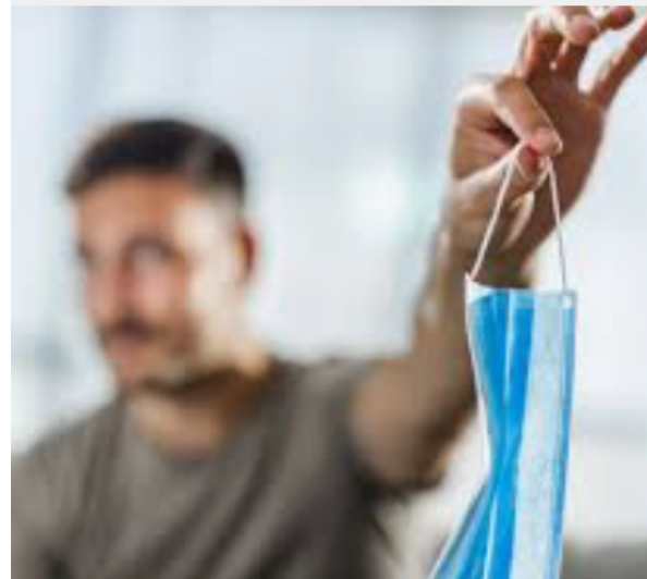
CBFANC Newsletter - June 2021 - Info Expeditor