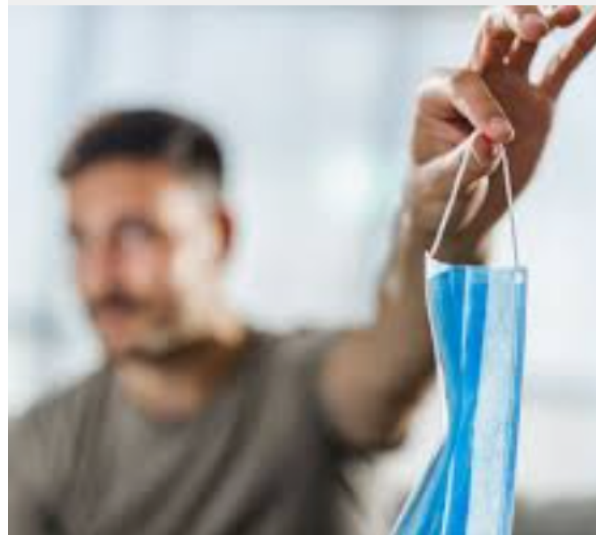
CBFANC Newsletter - May 2021 - Info Expeditor