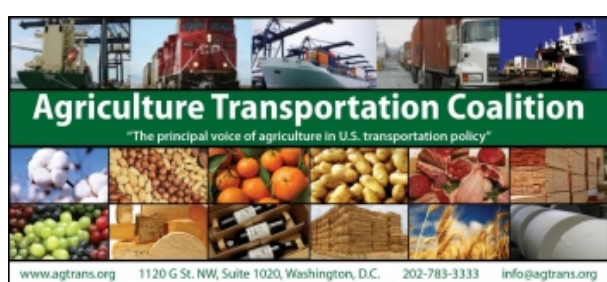
AgTC/Shipper Workshop - Oakland Thursday, October 3, 2019

10 AM -- Registration, Coffee and Danish, Workshop: 10:30 AM to 2:30 PM