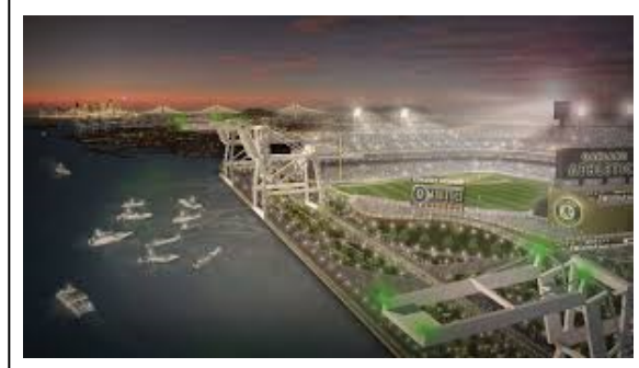
Tuesday, Oct. 8: City Council Committee Hearing on Draft Downtown Precise Plan